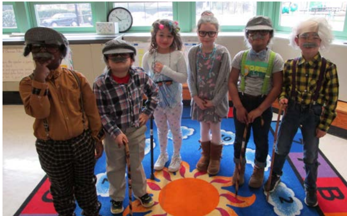
Some of our “Old”er students

Friday, January 31 st , was the 100th day of school for our first through fifth graders. Students wore purple and gold colors to school to show-off their Royal Spirit. All students received “100 Day Glasses” to color and wear for the day. In addition to our Royal Colors and 100-Day Glasses, students who were interested dressed and accessorized as if they were 100 years old!!! Our Kindergarten’s celebrated their special 100 th Day celebration on Friday, February 7 th . Ms. Ceribellii decorated our main hallways spectacularly!