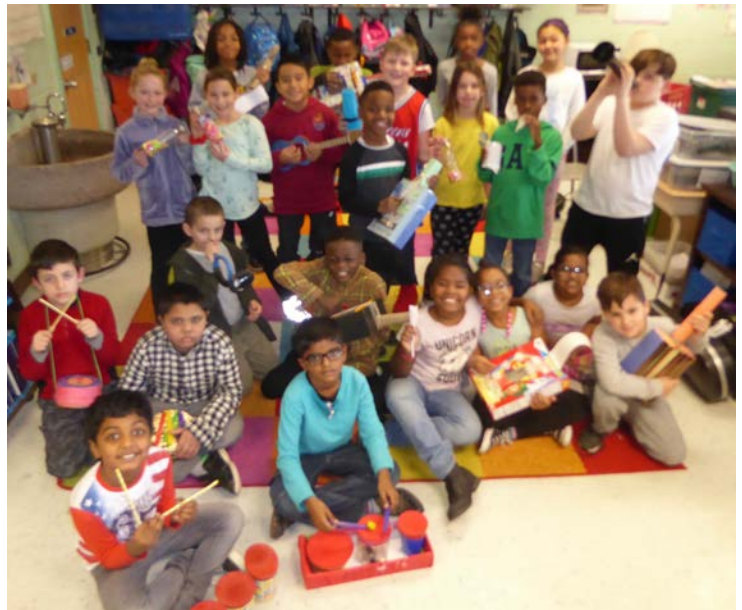
All of the third graders completed their Science units by creating and demonstrating their homemade instruments in January.