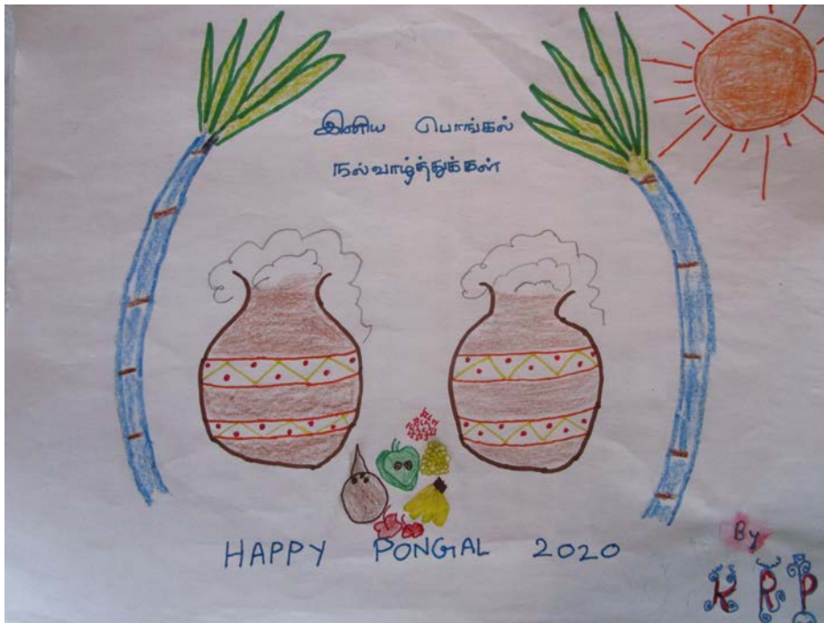
Drawing by Prathyush Karthileyon